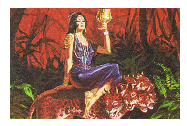
YOU WILL IDENTIFY THE SCARLET WOMAN

In eight short, action-packed weeks, the book of Revelation will come alive for you. When the Seminar ends, you will understand the book well enough to give a brief explanation of its contents, yourself. So, let's begin.