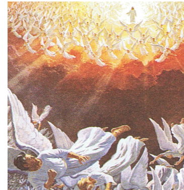
Satan and his followers were cast out of heaven

Ans. g. John. 8:44 ... he is a _____ and the _____ of it.