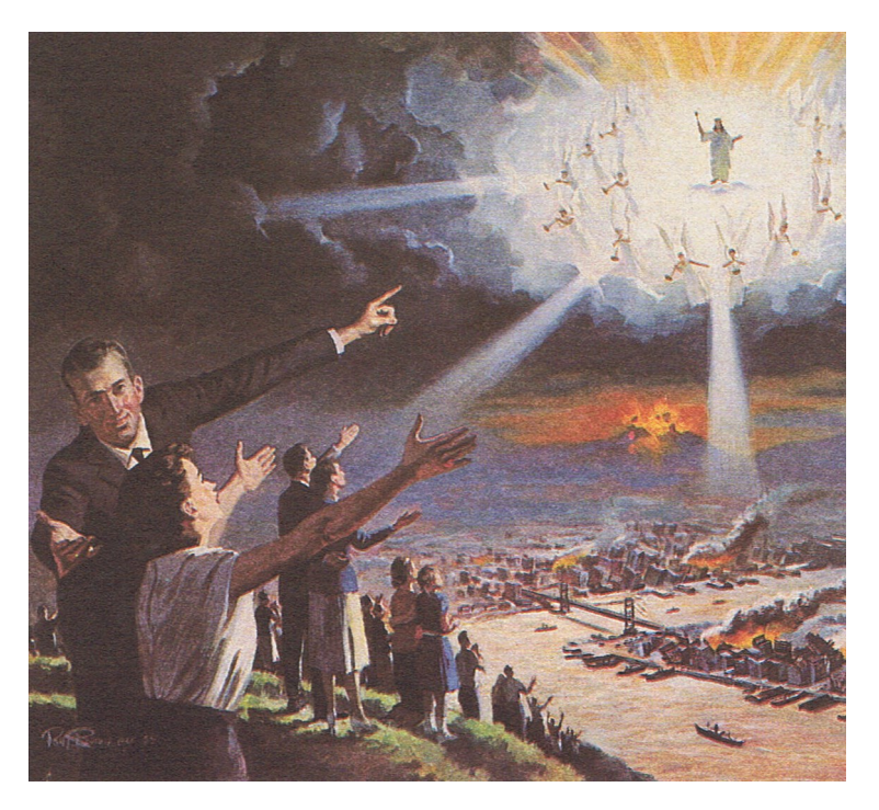
"Look up, and lift up your heads; for your redemption draweth nigh." Luke 21:28

Copyright 1983 Review & Herald Publishing Assn. and Revelation Seminars, Box 66, Keene, Texas 76059. Christian ethics dictate that this material not be copied without written permission.