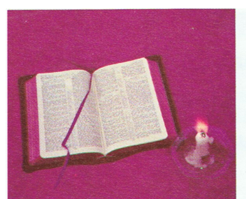
Test a prophe by the Bible.