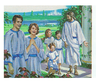
Love, not fear, prepares us for Heaven.

UNQUENCHABLE fire, and THE RICH MAN AND LAZARUS. For a discussion of these points see EXHIBITS # 1 and # 2.