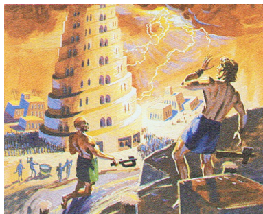
The word "Babylon" (from "Babel") means confusion.

NOTE: Babylon comes from the tower of Babel. The word means CONFUSION , (see Bible margin). The wicked decided to build a tower to reach high enough into the sky to escape another possible flood. God suddenly caused them all to speak different languages so it became impossible to finish the project because of the confusion that resulted. Since that day the name BABEL or BABYLON has stood for confusion