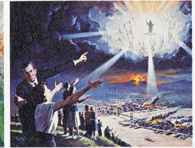
INVASION FROM SPACE