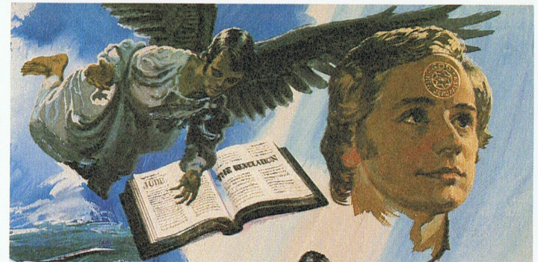
SEAL OF GOD

NOTE: IT IS SOBERING, INDEED, TO REALIZE THAT WE ARE NOW LIVING BETWEEN VERSE 13 and 14 OF THE SIXTH SEAL OF REVELATION 6. IT HAS BEEN 150 YEARS SINCE THE LAST SIGN, THE FALLING OF THE STARS. THE NEXT SIGN IS ABOUT TO APPEAR. "And then shall appear the sign of the Son of man in heaven: and then shall all the tribes of the earth mourn, and they shall see the Son of man coming in the clouds of heaven with power and great glory". Matthew 24:30 (1440). Please note that the sixth seal covers the time periods of both the sixth and seventh churches, Philadelphia and Laodicea — from about the middle of the 18th century to the coming of Jesus.