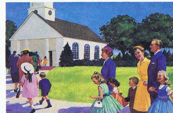
The Bible identifies God's Church.

NOTE: God's church will make it very clear that salvation and righteousness come by faith in Jesus Christ alone, Acts 4;12 (1596).