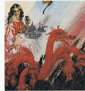
Babylon The Great!

17. DO YOU THINK JESUS LOVES THESE "OTHER" SHEEP? HE SURELY DOES! Jesus died for them!